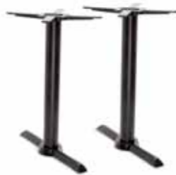
TA7404-4 TABLE (DOUBLE PEDESTAL)

Base height: 720 mm Max. top size: 1200 x 700 mm