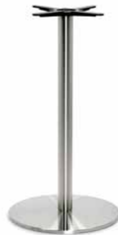
PTA7402-2 POSEUR TABLE

Base height: 1100 mm Max. top size: 900 mm diam. / 600 x 600 mm