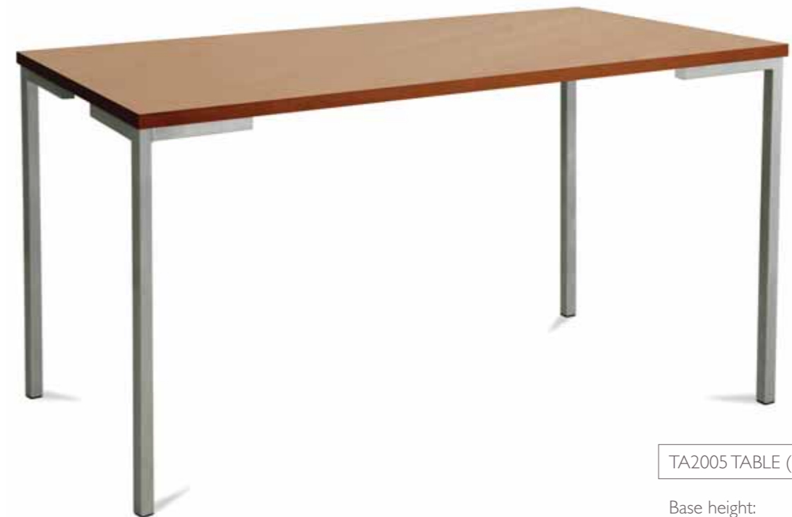
TA2005 TABLE (CORNER LEGS)

Base height: 685 mm Max. top size: 1800 x 1000 mm / 1500 x 1500 mm / 1500 mm diam.