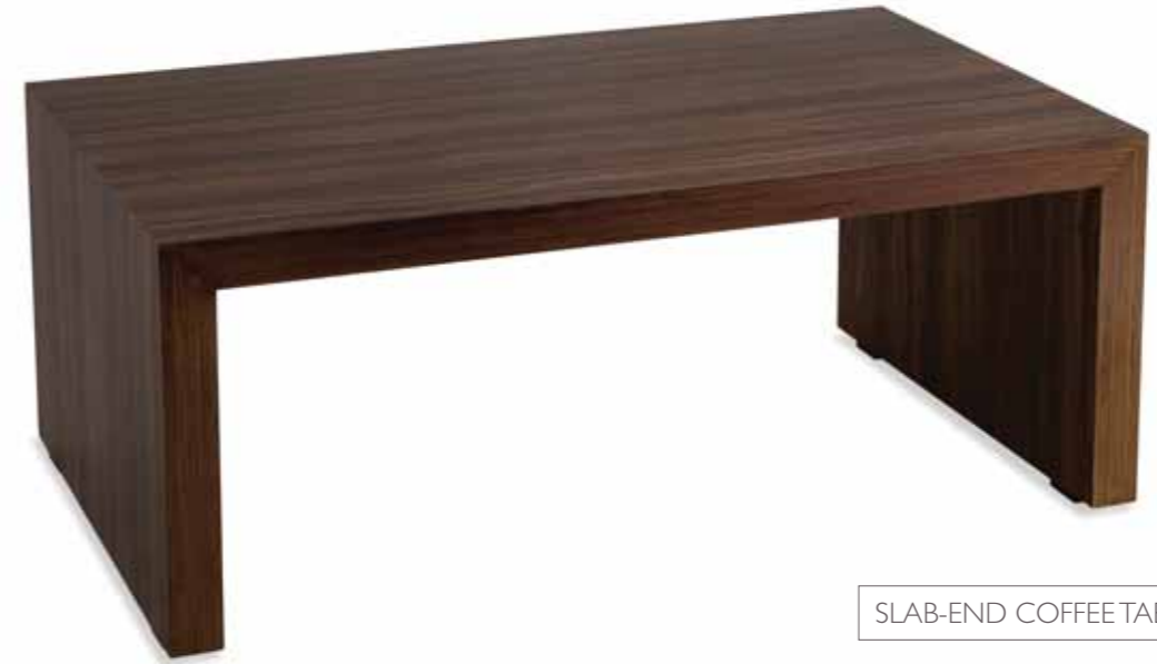
SLAB-END COFFEE TABLE

Height: 510 mm Top size: 610 x 610 mm (standard), other sizes available.