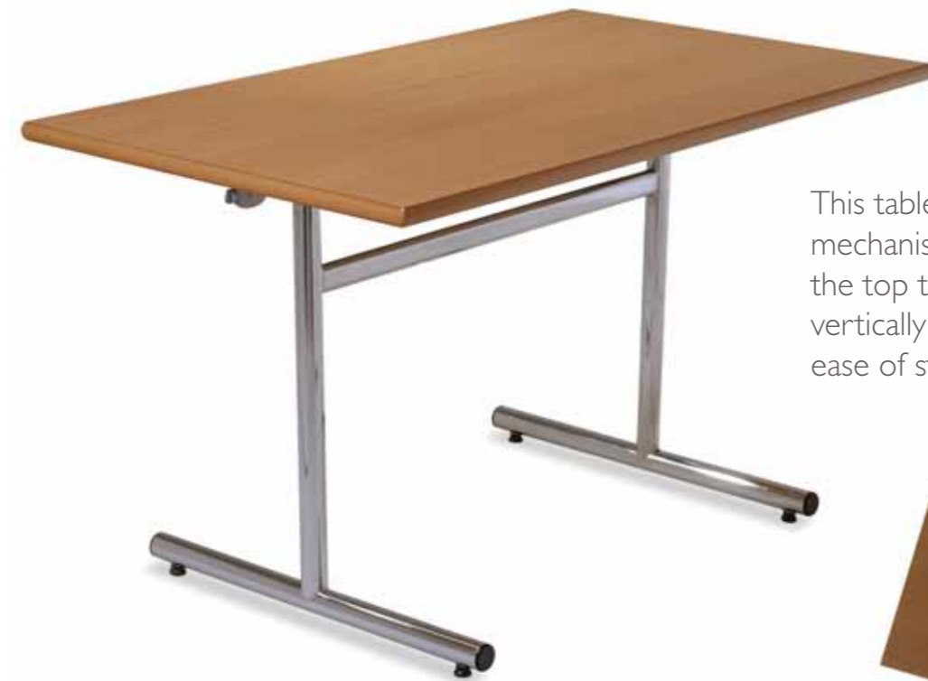
FLIP ST15 TABLE

Available finishes: these tables can be supplied with a chrome or ERP coated base. There is a wide variety of laminated MDF and melamine-faced chipboard tops available.