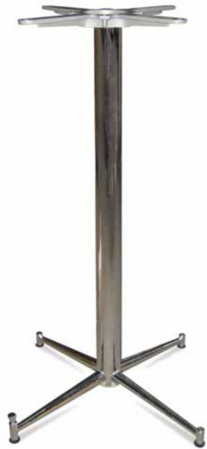
PTA7406-1 POSEUR TABLE

Base height: 1100 mm Max. top size: 600 mm diam. / 600 x 600 mm