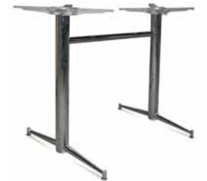
TA7406-3 TABLE (DOUBLE PEDESTAL)

Base height: 720 mm Max. top size: 1200 x 800 mm