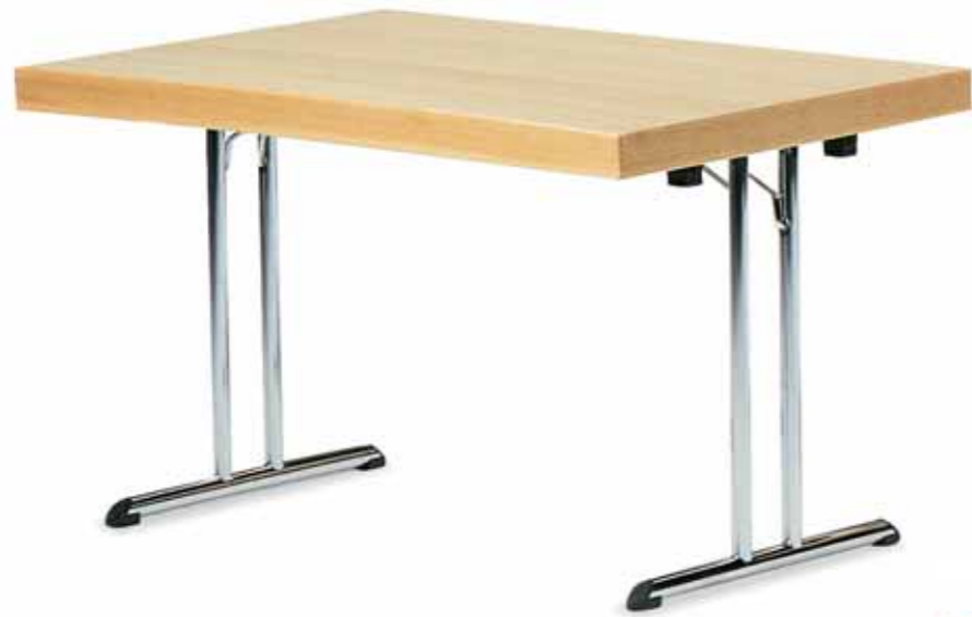
FT4601 FOLDING TABLE

Base height: 720 mm Min. top size: 1180 x 600 mm Max. top size: 1600 x 800 mm