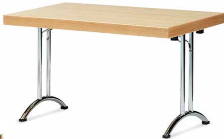
FT4603 FOLDING TABLE

Available finishes: these tables can be supplied with a chrome or ERP coated base. There is a wide variety of laminated MDF and melamine-faced chipboard tops available.