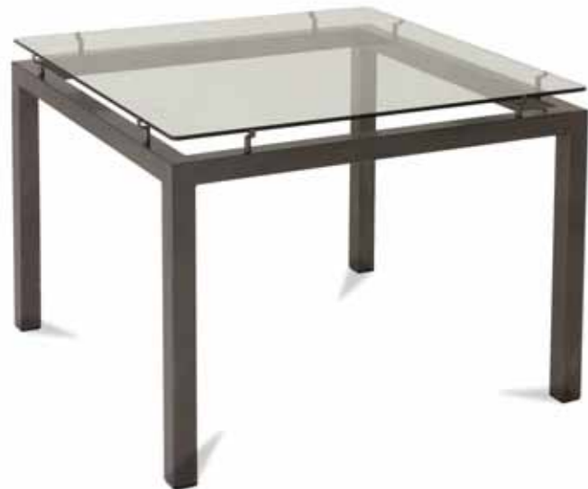
CT2006 COFFEE TABLE

Base height: 455 mm Max. top size: sizes on application