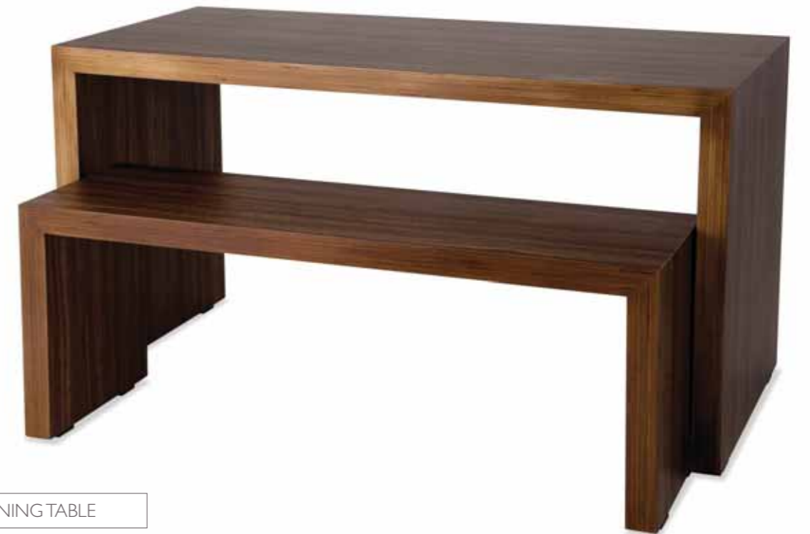
SLAB-END DINING TABLE

These tables have laminated surfaces, available in a wide range of finishes. Edges can be supplied in either laminate, Russian Birch ply or stained and polished MDF.