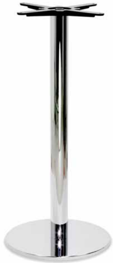
PTA7402-0 POSEUR TABLE

Base height: 1100 mm Max. top size: 700 mm diam.