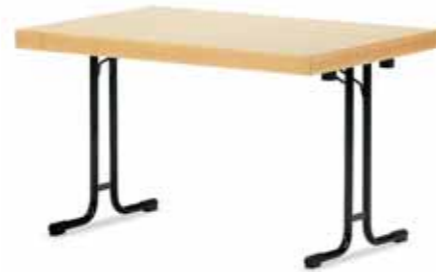
FT4602 FOLDING TABLE

Base height: 720 mm Min. top size: 1180 x 600 mm Max. top size: 1600 x 800 mm