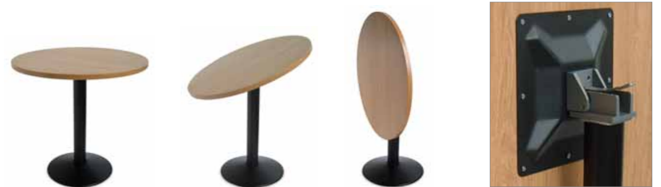
Table top finishes

All of the table bases on pages 1-9 can be supplied with an optional flip-top mechanism. The mechanism is robustly made and simple to use.