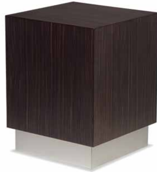
CT2001 COFFEE TABLE

Height: 510 mm Top size: 400 x 400 mm (standard), other sizes available.