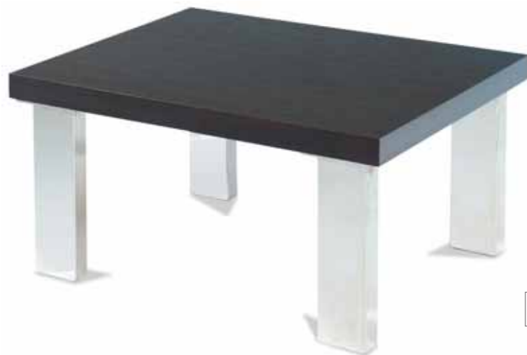
CT2003 COFFEE TABLE

Available finishes: these tables can be supplied with a chrome or ERP coated base.