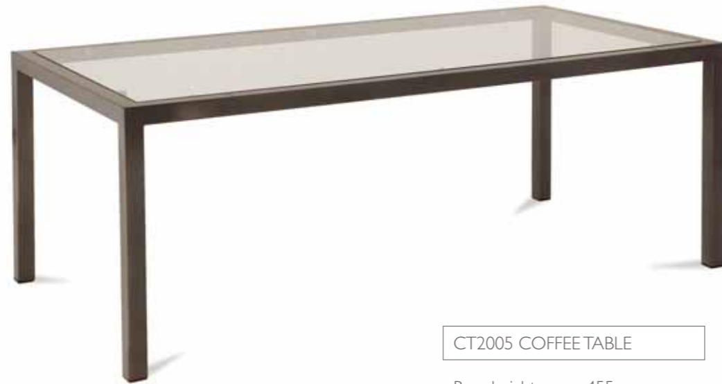
CT2005 COFFEE TABLE

Base height: 455 mm Max. top size: sizes on application