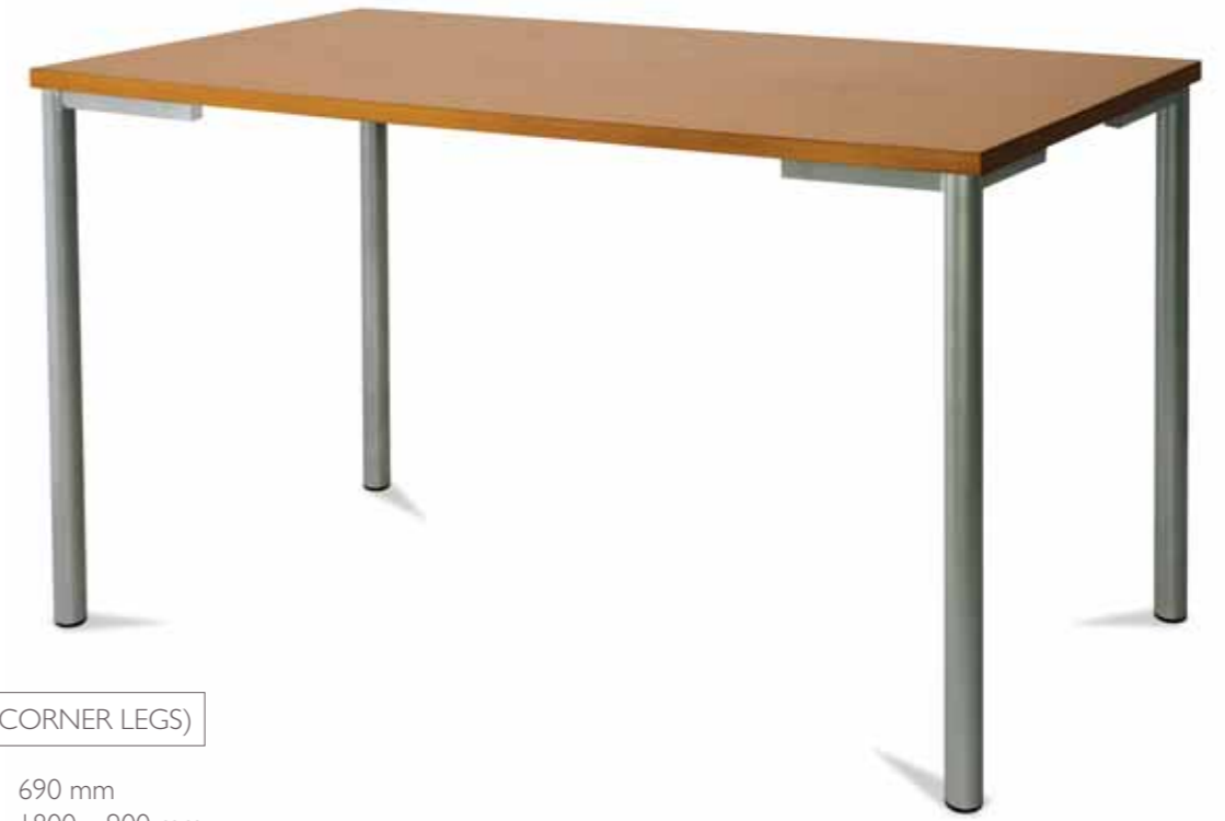
TA2006 TABLE (CORNER LEGS)

Available finishes: these tables can be supplied with a chrome or ERP coated base. There is a wide variety of solid ash, laminated MDF and melamine-faced chipboard tops available.