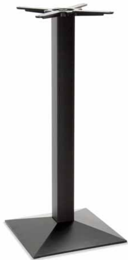
PTA7405-0 POSEUR TABLE

Base height: 1100 mm Max. top size: 600 x 600 mm